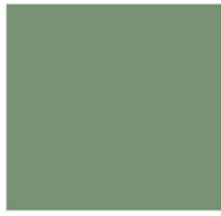
CCS MOSS GREEN 6%