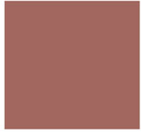
CCS CLAY COURT 3%