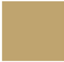
CCS SUNDANCE 6%