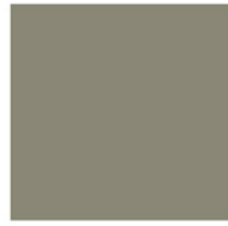
CCS RHINO 3%