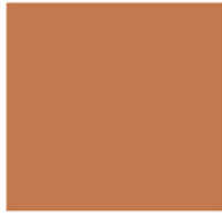
CCS TERRACOTTA 6%