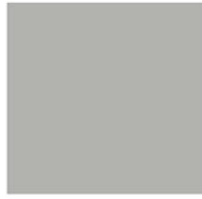
CCS PEWTER 6%