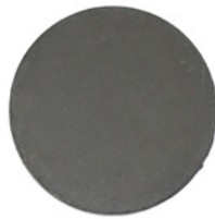
CCSolutions Fly Ash