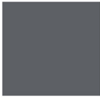
CCS VODOO 87 8%