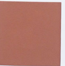
Colonial Red (1)