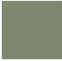
CCS KAKADU 6%