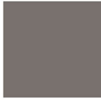
CCS ONYX 44 3%