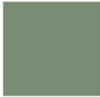
CCS MOSS GREEN 6%