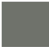
CCS JUNGLE 6%