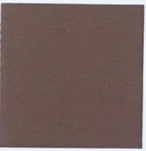
Red Rock (2)