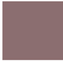
CCS MULBERRY 4%