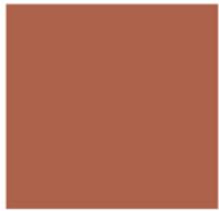
CCS TERRACOTTA 6%