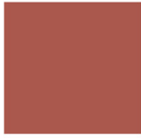
CCS RUBY 6%