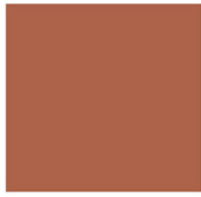
CCS BRICK RED 6%