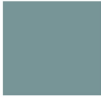
CCS COBALT BLUE 3%