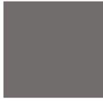
CCS ZEUS 6%