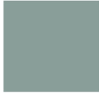
CCS TROPICANA 3%