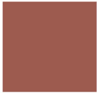
CCS RUBY 6%