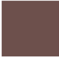
CCS CHOCOLATE 6%