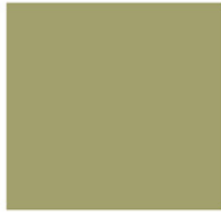
CCS ARTICHOKE 3%