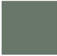
CCS JUNGLE 6%